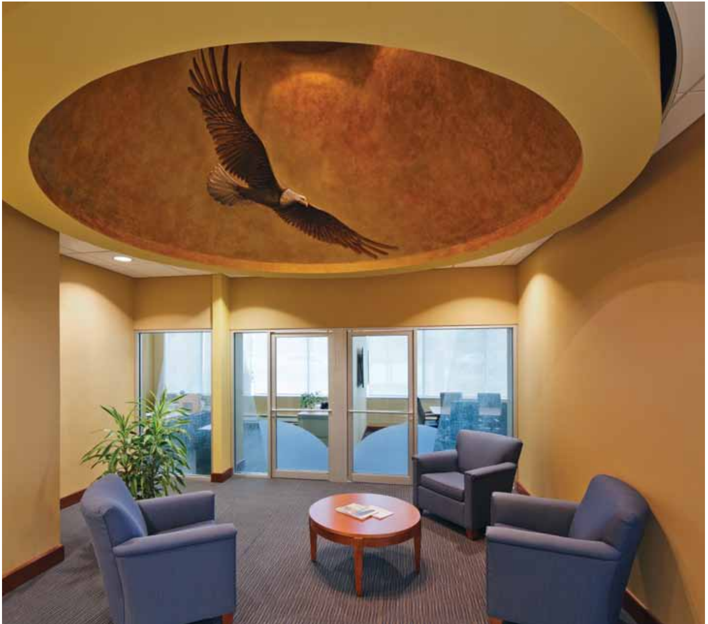
EagleBank Park Potomac Branch, Potomac, Maryland. The branch lobby features a ceiling eagle mural by ATS Studios. With our seven Montgomery County branches and our Bethesda, Maryland headquarters, EagleBank's Maryland connections get stronger every day.